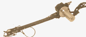
XD1 $1,566.00 XD1 CIRCUIT PULLER STOCK# 65090901

BUY 2 MAXIS® XD1 CABLE PULLERS GET 1/4" X 300FT QWIKROPE® FREE