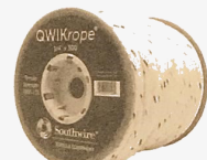
SPR-143 $342.00 FREE SIMROPE, SPR-143 1/4" X 300' PULLING ROPE STOCK# 58387501